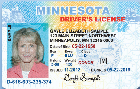
Standard Driver's License